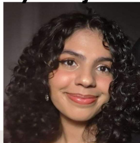
3rd Year Co-Pres