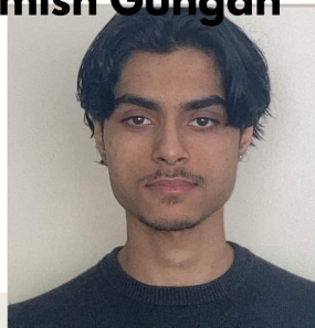
3rd Year Co-Pres